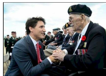
Your attention one day per year is not enough!

In 2022, Auditor General Karen Hogan tabled a scathing report in the House of Commons, exposing a deeply flawed system at VAC, where critical delays persist in compensating injured veterans. Despite repeated initiatives to speed up processing, veterans from the Canadian Armed Forces and the Royal Canadian Mounted Police still face unacceptable wait times for the benefits they rightfully deserve. Alarming, these issues mirror those flagged in a 2014 Auditor General audit—showing little meaningful progress in a decade. The time has come for the Government of Canada to fulfill its commitment to veterans and resolve this chronic problem. Simply showing up once a year on November 11th is not sufficient.